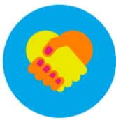
PEOPLE, COMPANIES & COUNCILS CAN COLLABORATE