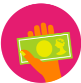
ANYONE CAN BACK CHANGE