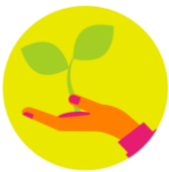
ANYONE CAN CREATE A PROJECT